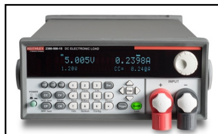
Model 2380-500-15 front view showing the safety covers on the input terminals.