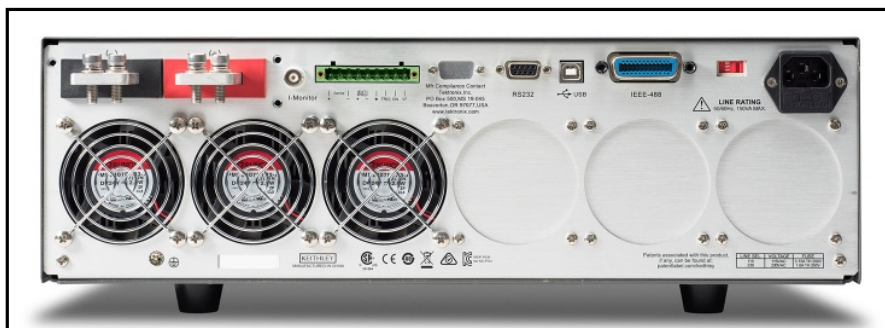
Model 2380-500-30 rear panel