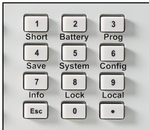
Figure 1. Use either the rotary knob or the keypad to quickly enter settings and set parameter values using all the available resolution.

Series 2380 programmable DC electronic loads can sink a wide range of voltages and currents. The 200W Model 2380-500-15 can accept up to 500V or 15A. The 250W Model 2380-120-60 can accept up to 120V or 60A. The 750W Model 2380- 500 30 can accept up to 500V or 30A. These single-output, stand-alone electronic loads are cost-effective and self-contained.