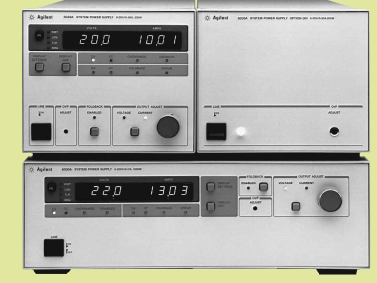
6030A, 6031A, 6032A, 6035A

This series of 200 watt and 1000 watt dc power supplies take the place of multiple power supplies in your test system by providing maximum power at a variety of operating points.