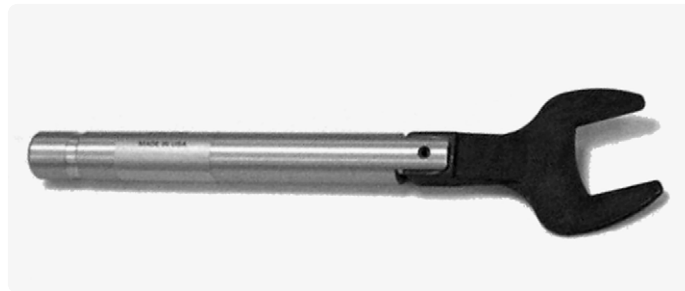
Agilent 20mm torque wrench 8710-1764

The APC-3.5 (m) connector used on the SNS Series of noise sources has an extra-large nut to make it easier to tighten without applying torque to the noise source body. A 20 mm torque wrench is also available from Agilent for this application. Please contact your local Agilent representative for ordering information.