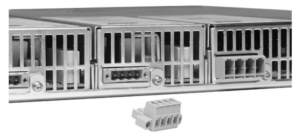
Figure 5. Quick disconnects for power and sense leads

The N6700 is easily rack-mounted using the N6709C rack mount kit. This kit provides all the necessary hardware to rack mount one N6700 mainframe in only 1U of rack space. This rack mount kit includes front rack ears and rear supports which take the place of standard rack rails and/or slides. Note that standard rack rails or slides are not compatible with the N6700 because of its 1U size and airflow requirements.