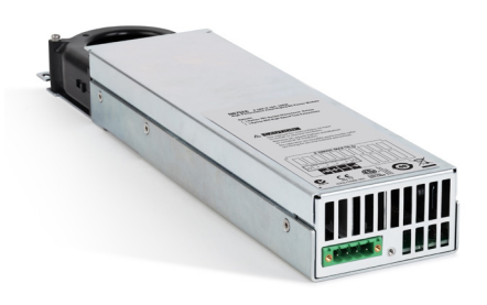
Figure 6a. The basic series

The Keysight N6750 Series of highperformance, autoranging DC power modules provides low noise, high accuracy and programming speeds that are up to 10 to 50 times faster than other programmable power supplies. In addition, Keysight has, for the first time, included high-speed test extensions in generalpurpose power supplies. The high-speed test extensions offer an oscilloscope-like digitizer that simplifies system configuration and increases measurement accuracy when viewing high-speed transient or pulse events within the DUT. In addition, autoranging output capabilities enable one power supply to do the job of several traditional power supplies.