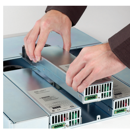
Figure 6c. User re-configurable modular system

www.keysight.com/find/N6783A-BAT www.keysight.com/find/N6783A-MFG and download the N6783A-BAT Data Sheet , 5990-8662EN and the N6783A-MFG Data Sheet , 5990-8643EN.